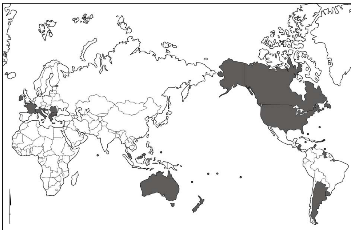
Figure 2: Countries asking a question on year or date of arrival of foreign-born persons in the 2000 round of population censuses