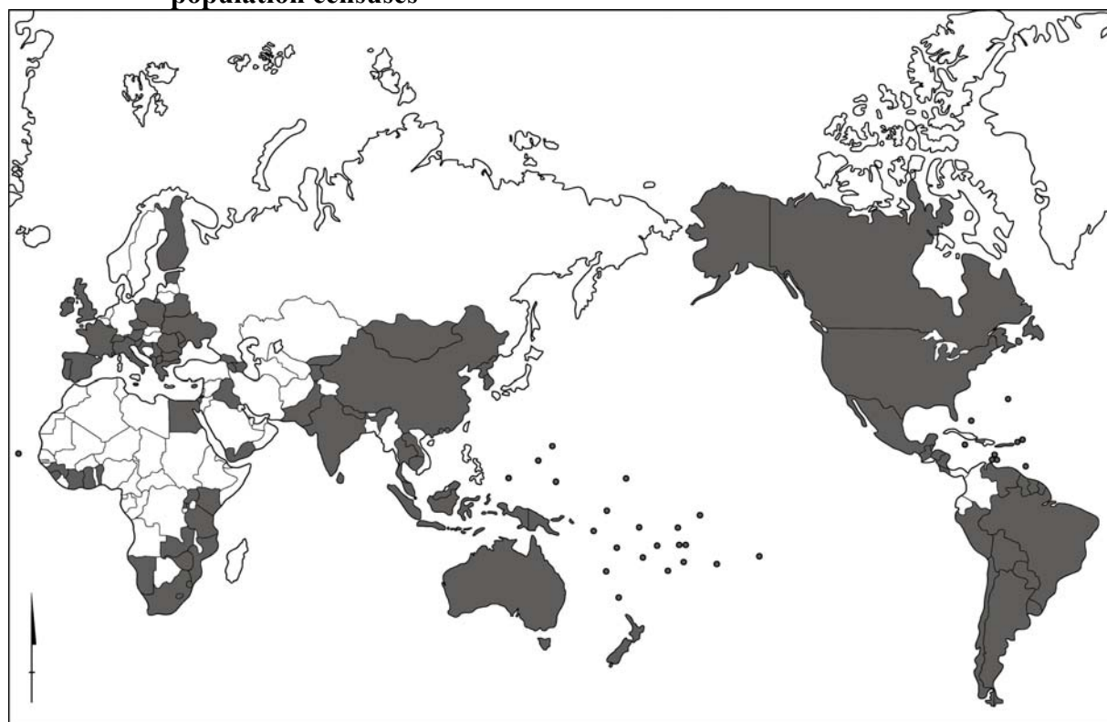
Figure 1: Countries asking a question on place of birth in the 2000 round of population censuses