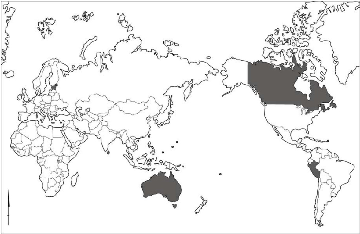
Figure 4: Countries asking questions on place of birth of parents in the 2000 round of population censuses

Source: United Nations Statistics Division Census Database